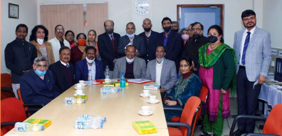
NAAC Peers Team Member group photograph with SOE