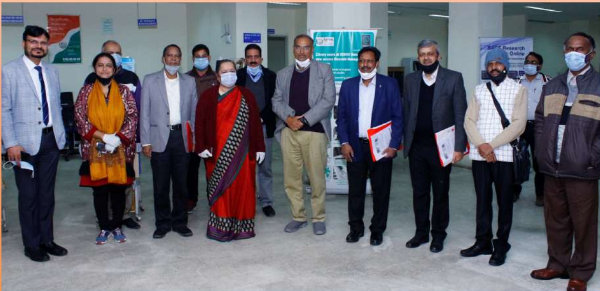
NAAC Peers Team Member group photograph with Library Team