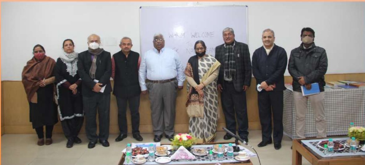
NAAC Peers Team Member group photograph with P&DD