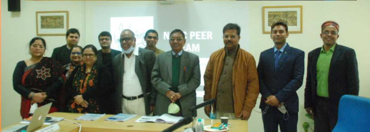
CoE Group photograph with NAAC team