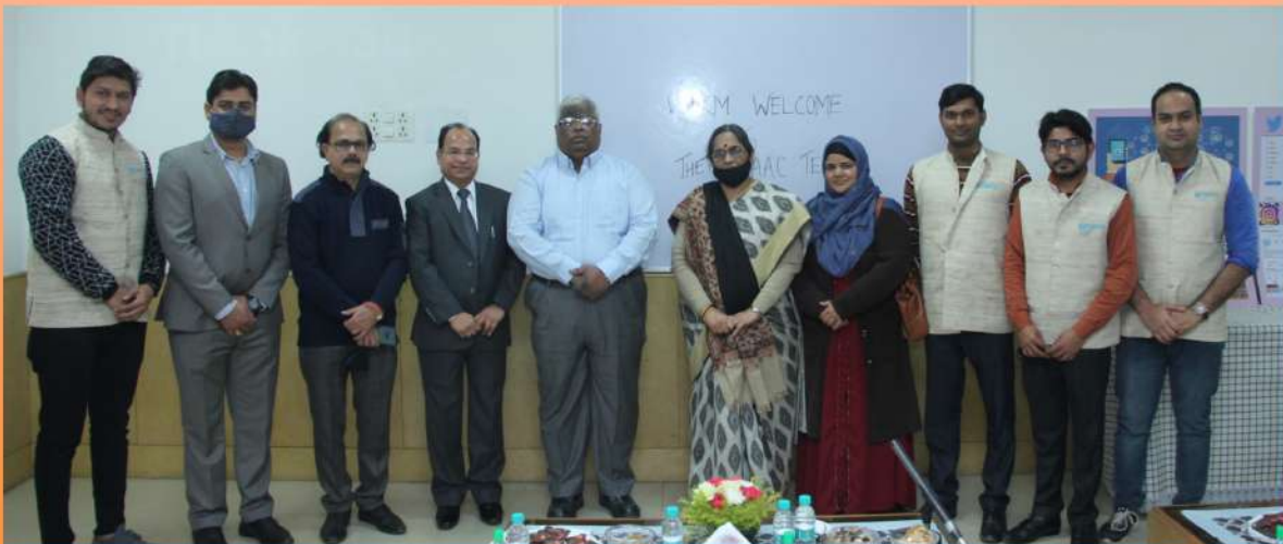
NAAC Peers Team Member group photograph with SSC