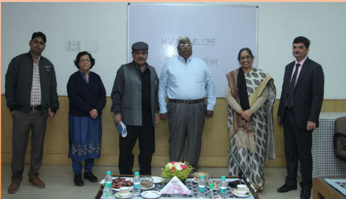
NAAC Peers Team Member group photograph with P&DD