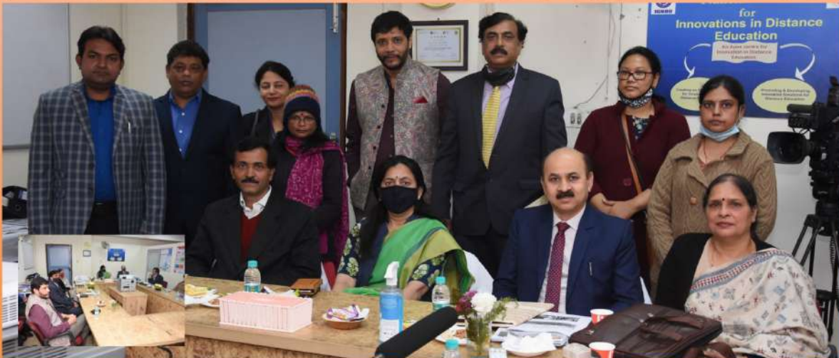
NCDS Group photograph with NAAC team