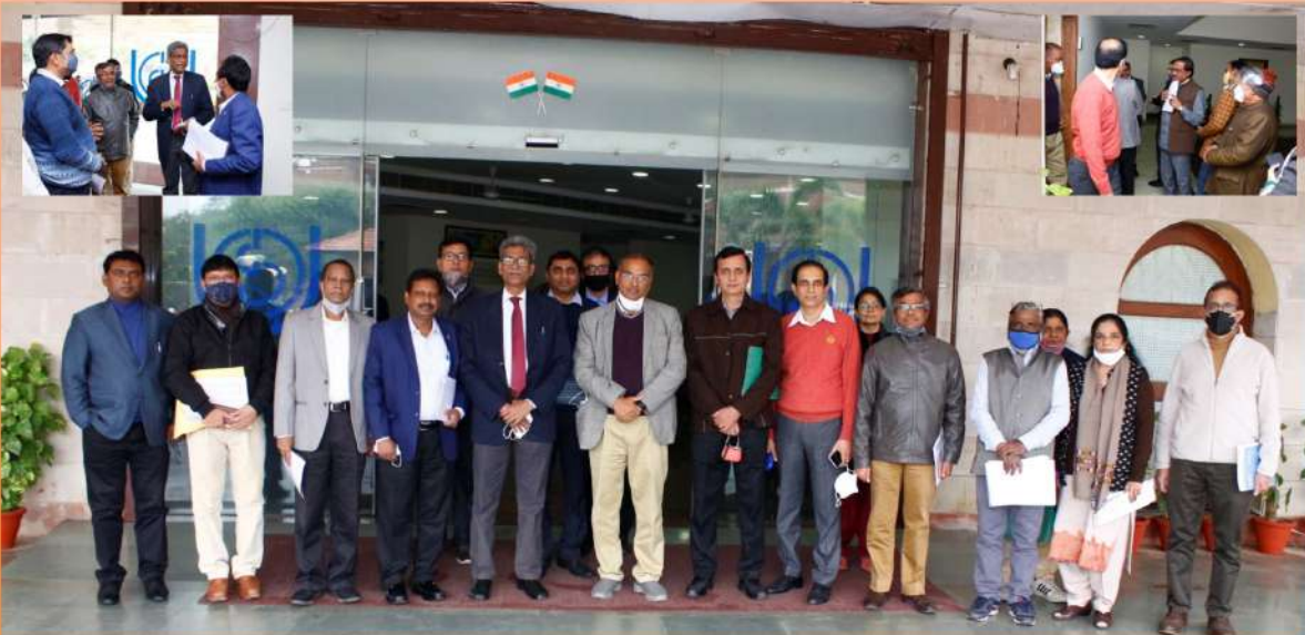
NAAC Peers Team Member group photograph with SED