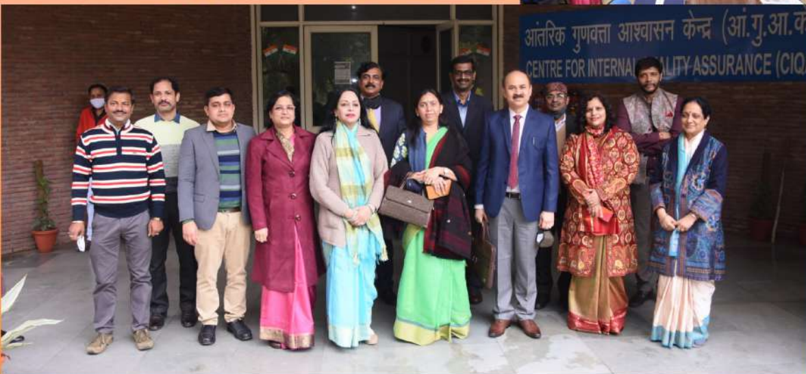
NAAC Peers Team Member group photograph with CIQA