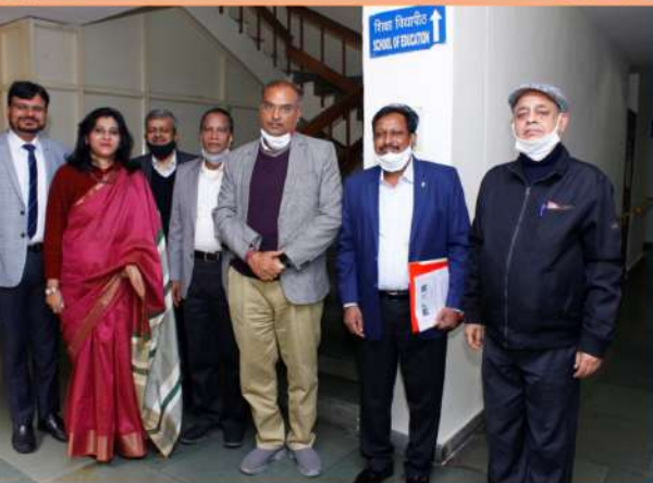
NAAC Peers Team Member group photograph with SOCE