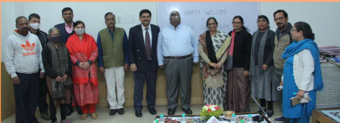
NAAC Peers Team Member group photograph with ACD