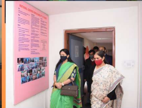
NAAC Peers Team Members visit NCIDE and NCDS