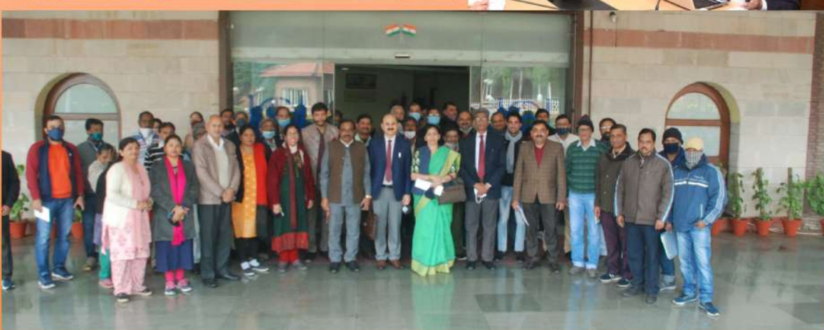
NAAC Peers Team Member group photograph with Administration