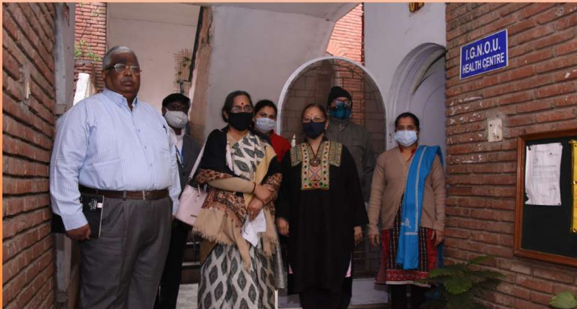
NAAC Peers Team Member group photograph with Health Centre Staff