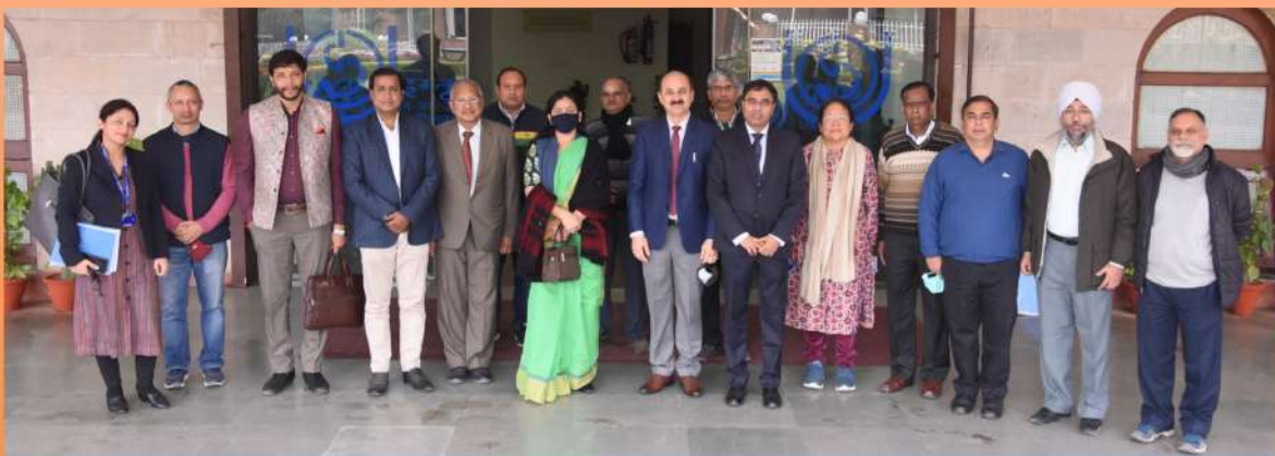
NAAC Peers Team Member group photograph with Finance Division 3