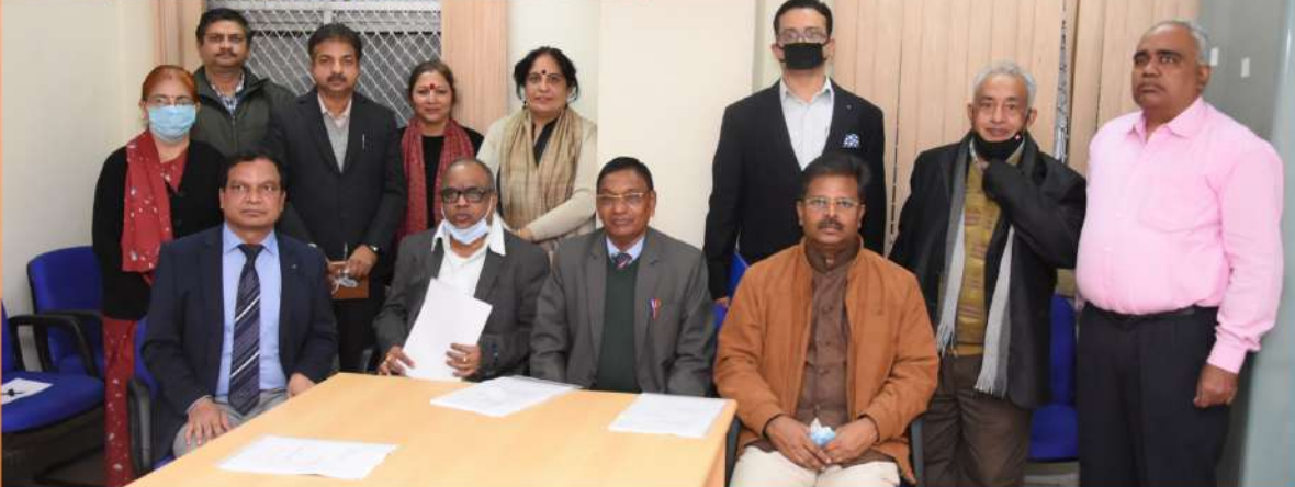
Members visit the facility of Computer Division