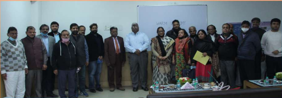
NAAC Peers Team Member group photograph with MPDD