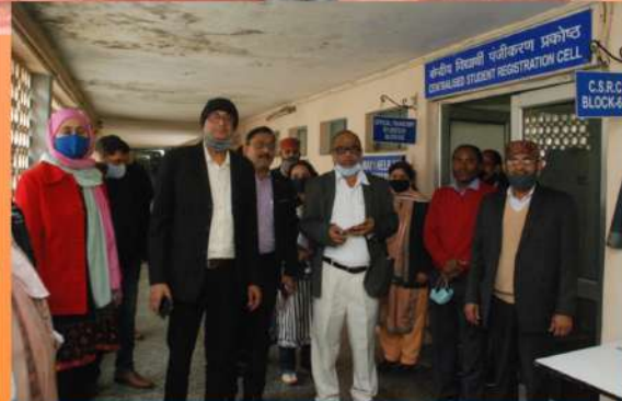
Members of the team visit to CSRC