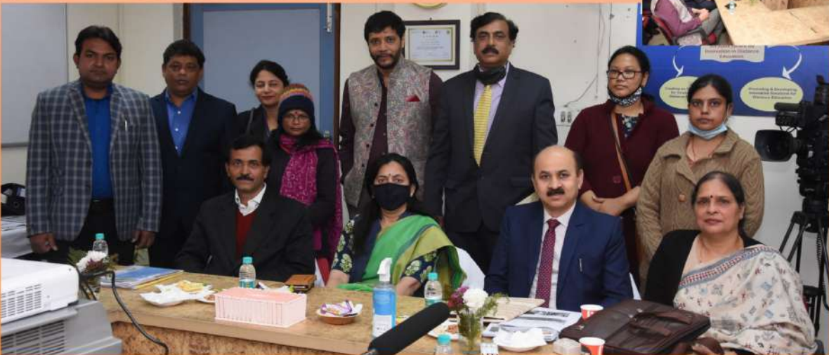
NCIDE Group photograph with NAAC team